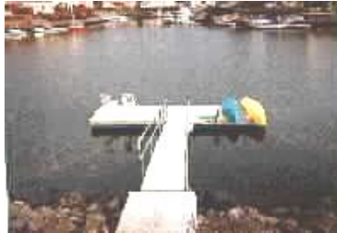
Sample T-Dock w/Ramp