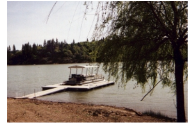
Sample U-Dock w/floating walkway